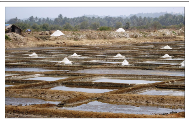
Figure 2 Salt production at Siridao located in Tiswadi taluka of Goa. Precipitated salt is heaped and kept for drying at the corners of the crystallizer pans.

from the states of Gujarat, Rajasthan and Tamil Nadu, which is about 90% of the country's total production [16]. Salt production methods vary widely among the different salt producing states. Apart from sea water, sub-soil brine, lake brine and rock salt deposits are also being used for salt production [17]. Private sector plays a major role in salt production, contributing 90.3%. Most of the salt pans have iodisation plants located nearby for fortifying the salt with iodine and iron. Looking at the scenario of other Indian salt producing states, Goa's salt production fails to meet its local demand.